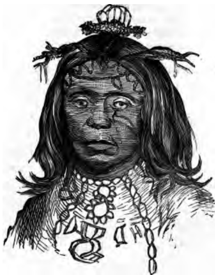
WIFE OF HYAS CLOSE.

wore broad bands of silver round their arms, some had as many as three on each arm. Similar bands were worn on the ankles of a few; earrings and nose-jewels were in profusion—so much so that I doubted their genuineness, but, upon examination and inquiry, I was informed that they would wear nothing but sil-